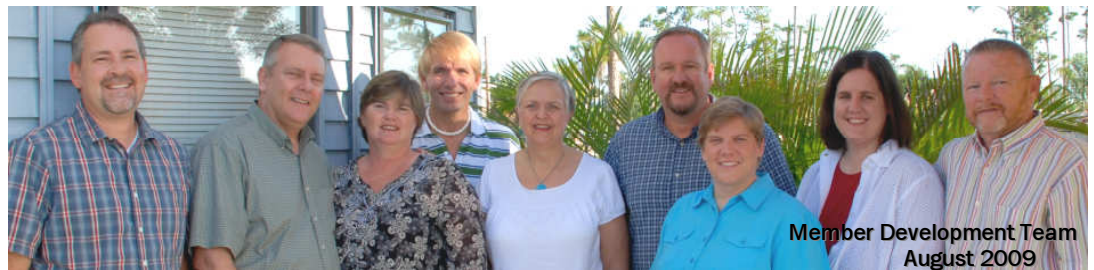
Member Development Team August 2009

Take a moment to read this update to learn the latest about who we are and what services we provide for you!